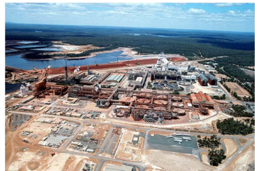
The Worsley Alumina Project, W.A.